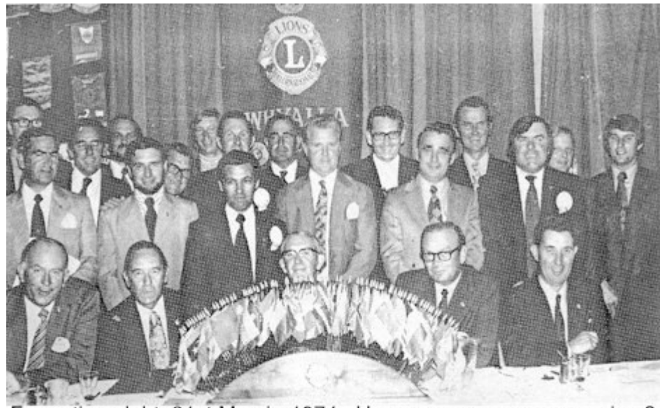
Formation night, 21st March, 1974. How many can you recognise ?.

In 1974, the Lions Club of Whyalla investigated the possibility of forming a second Lions Club in the City of Whyalla.