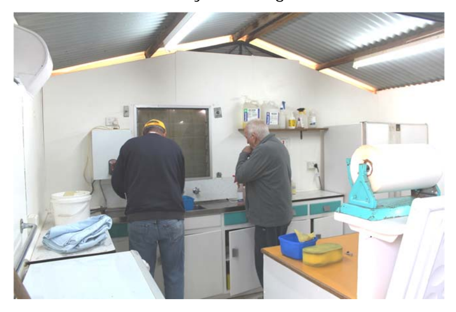
Cleaning Dutch Shed