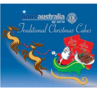
Lions Christmas Cakes - 1kg & 1.5kg