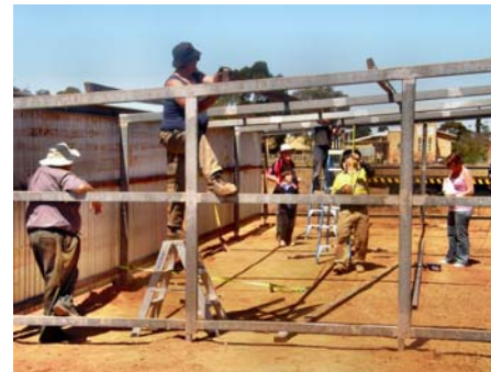
Putting rafters on