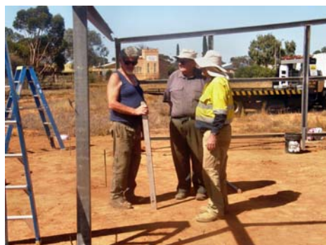
Serious discussion—3 musketeers