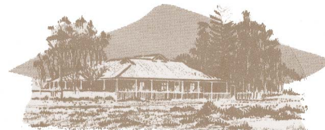
Mt. Laura Homestead National Trust Museum