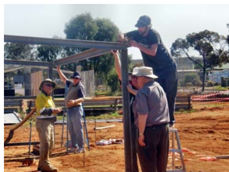
Connecting it all